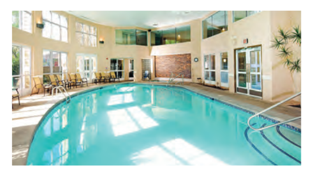
HEATED INDOOR POOL AND HOT TUB Unwind after a long day exploring one of the seven natural wonders of the world in our heated indoor pool and hot tub.

Two triple-sheeted queen beds, full bath with granite countertops, satellite TV, mini-fridge, air conditioning, and Keurig coffee maker.